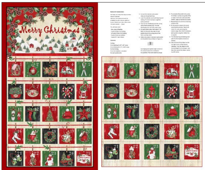
2292P-88 Advent Calendar Panel Red