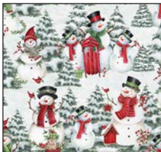
2287-01 Scenic Snowmen - White