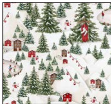
2288-01 Winter Scenic - White