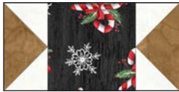
Figure 2 - Make 4.

2. Noting fabric orientation, sew a Step 1 unit to opposite sides of one 3" 2285-99 Candy Canes – Black square ( figure 2 ). Press the seams toward the center. Repeat to make four block centers.