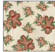
2286-41 Gingerbread Cookies - Tan