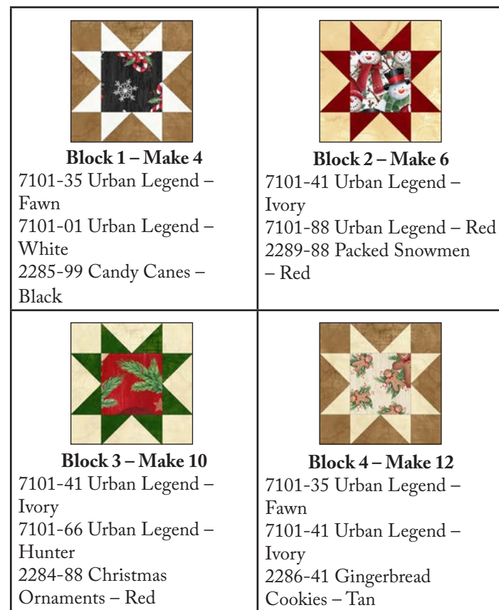
Table 1. Block colorway.

Note: Measurements include 1/4" seam allowances. Sew with right sides together unless otherwise stated. If no direction is specified, press the seam toward the darker fabric.