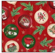
2284-88 Christmas Ornaments - Red