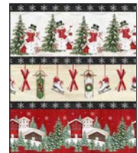
2291-88 Christmas Border Stripe - Red