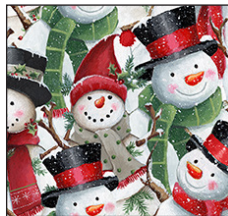
2289-88 Packed Snowmen - Red