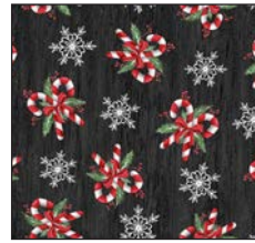
2285-99 Candy Canes Black