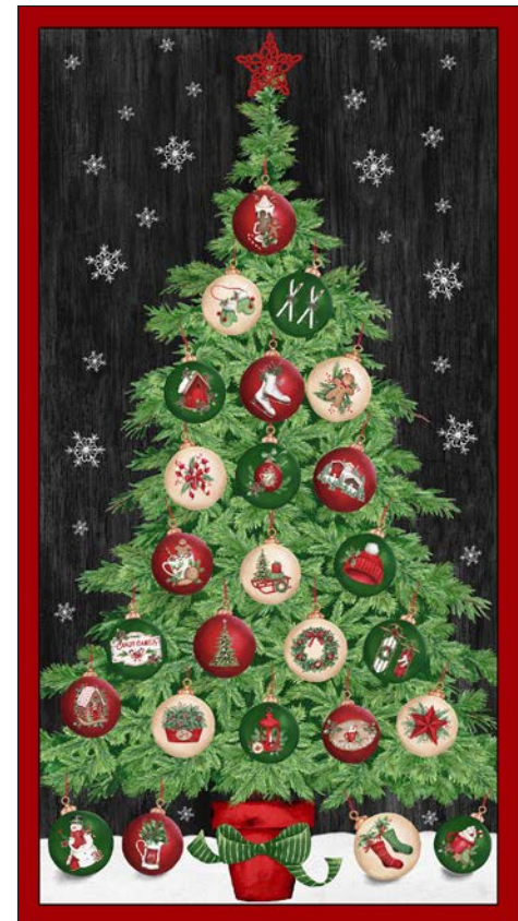
2293P-66 Christmas Tree Panel - Green

Selected fabrics from the Urban Legend Collection by Tana Miller