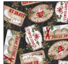
2290-99 Christmas Signs - Black