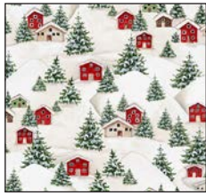
2283-01 Snowy Village White